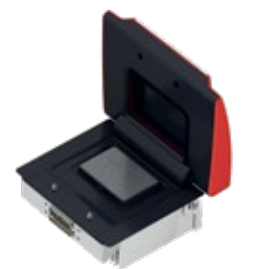
384-well aluminum-block module

For very high reaction volumes in 0.5 ml tubes