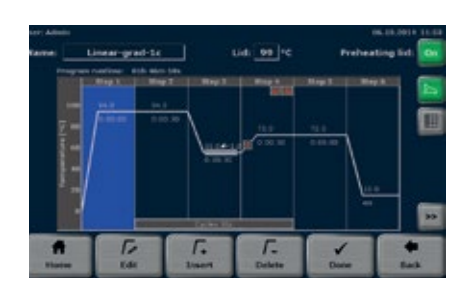
Graphical programming interface

Users are always on the safe side: On a regular basis or based on individual need, an extended self-test can be carried out to check all relevant features such as cooler, heating, cooling rates and more. All results are stored in a report and can be shared with the technical service.